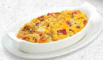
Mac 'N' Cheese with Chicken Bacon