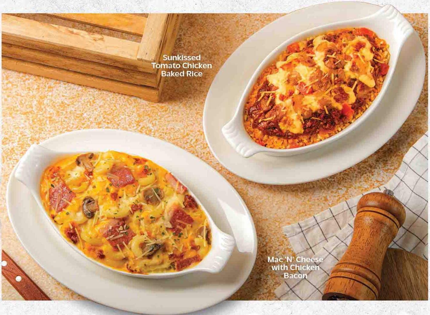
Sunkissed Tomato Chicken Baked Rice