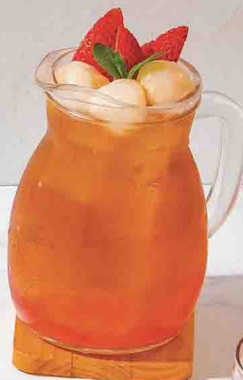
Strawberry Lychee Iced Tea