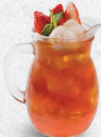
Strawberry Lychee Iced Tea

A sunny blend of mango puree and tea, finished with juicy diced peaches and chia seeds for a lightly sweet and richly flavourful gulp.