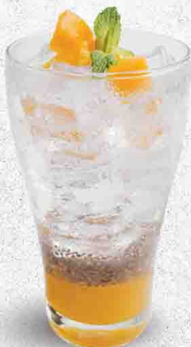
Peachy Mango Fizz

Bursting with berry goodness! Mixed berry puree with a pop of chia seeds, finished with sparkling soda and topped with berries.