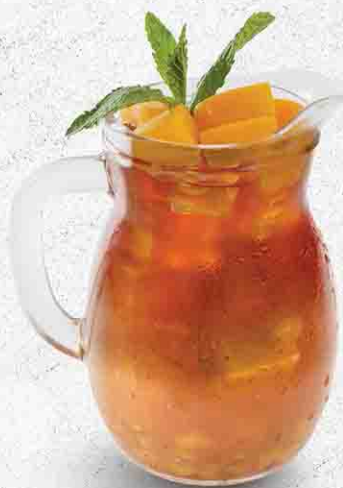
Peachy Mango Iced Tea

A refreshing swirl of tea and berry puree with a pop of chia seeds. Topped with berries for an energizing and flavourful sip.