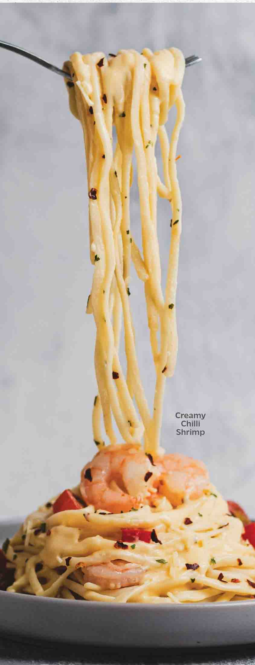
Creamy Chilli Shrimp

Fresh succulent prawns, cherry tomatoes and pasta tossed with garlic, chilli flakes, chilli padi and olive oil, topped with parmesan cheese.