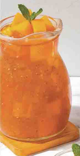
Peachy Mango Iced Tea