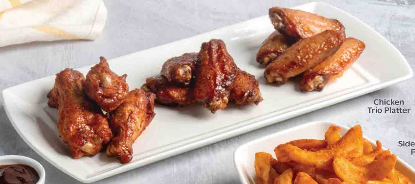
Chicken Trio Platter