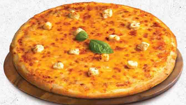
The Four Cheese 🌿

Spicy chicken chunks, chicken ham, luscious pineapple chunks with fresh capsicums, baked on a sweet and smoky BBQ sauce.