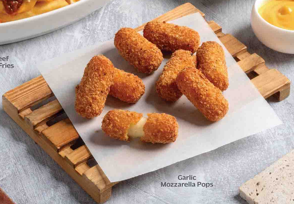
Garlic Mozzarella Pops