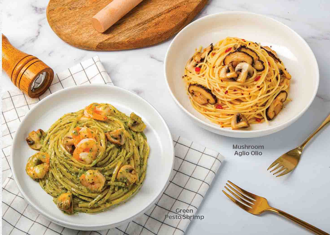
Mushroom Aglio Olio