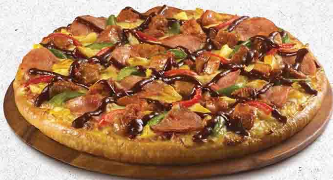
BBQ Chicken 🍷

Spicy chicken chunks, chicken ham, luscious pineapple chunks with fresh capsicums, baked on a sweet and smoky BBQ sauce.