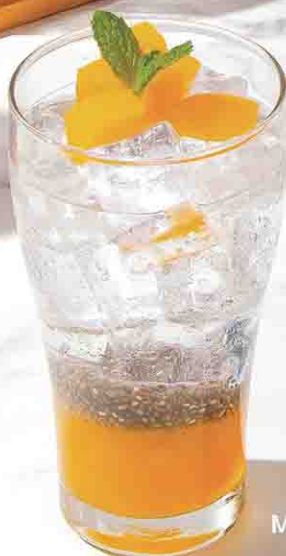
Peachy Mango Fizz