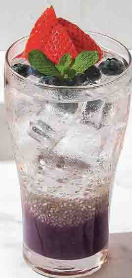
Berry Blaster Fizz