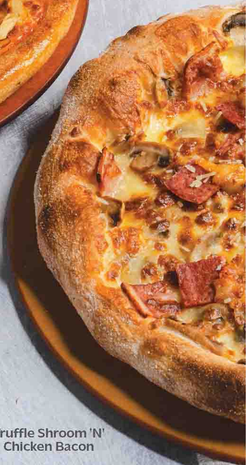
Truffle Shroom 'N' Chicken Bacon