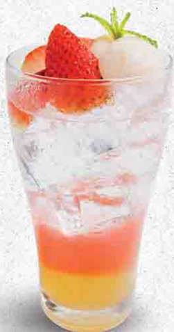
Strawberry Lychee Fizz