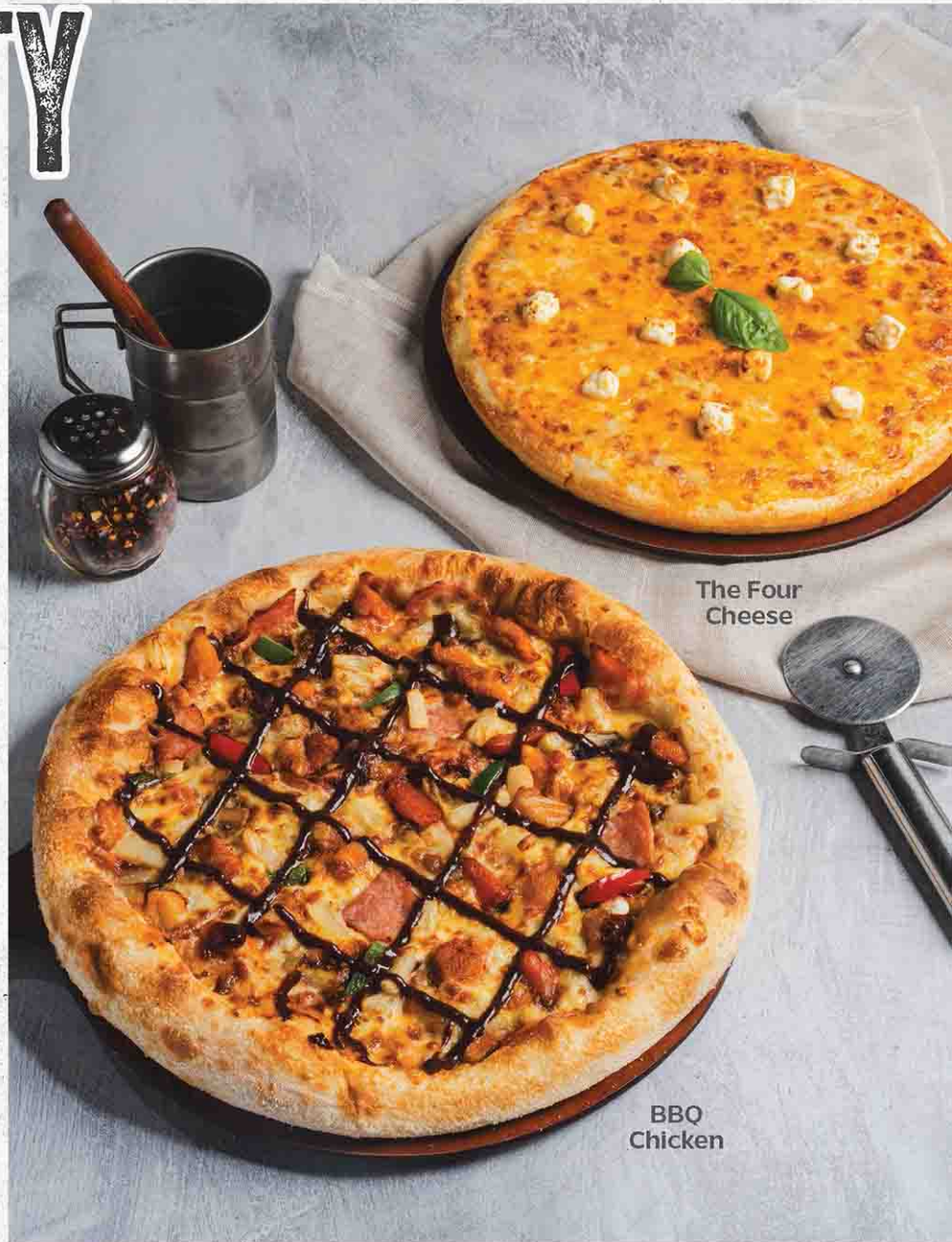
The Four Cheese