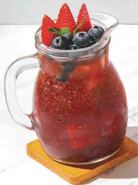
Berry Breeze Iced Tea

Tropical and refreshing with a golden blend of mango puree and juicy diced peaches with a pop of chia seeds and a splash of soda.