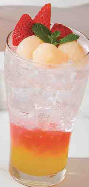
Strawberry Lychee Fizz