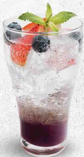
Berry Blaster Fizz