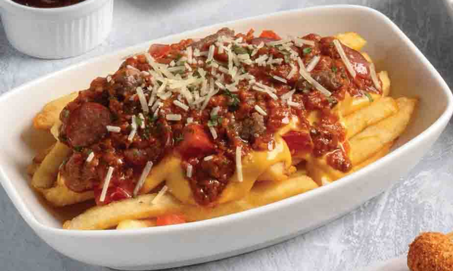
Loaded Beef Bolognese Fries