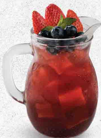
Berry Breeze Iced

Luscious lychee puree and strawberry wedges topped with mini jelly bits and refreshing soda.